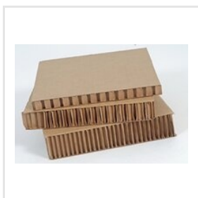
Paper Honeycomb Sheet