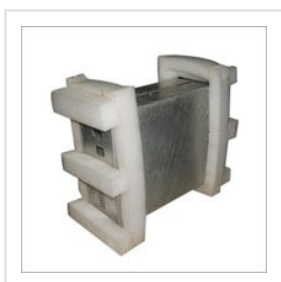
EPE Foam Fitments Packing