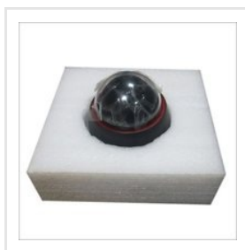
EP FOAM PRODUCT