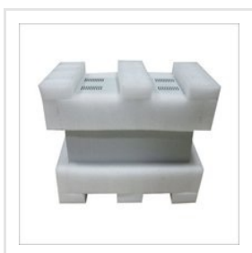
EP FOAM Box