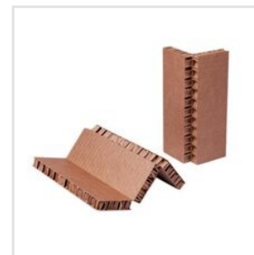
Brown Paper Honeycomb Corner