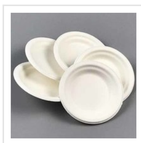
Eco Friendly Plates