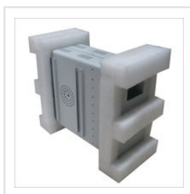
White EP FOAM