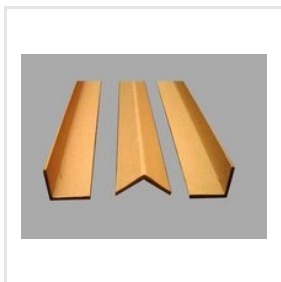
Paper Angle Board