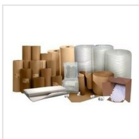
Epe Foam Sheets, Fitments And Rolls