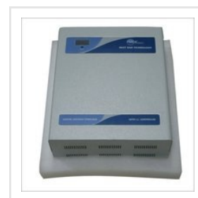
EP FOAM Product